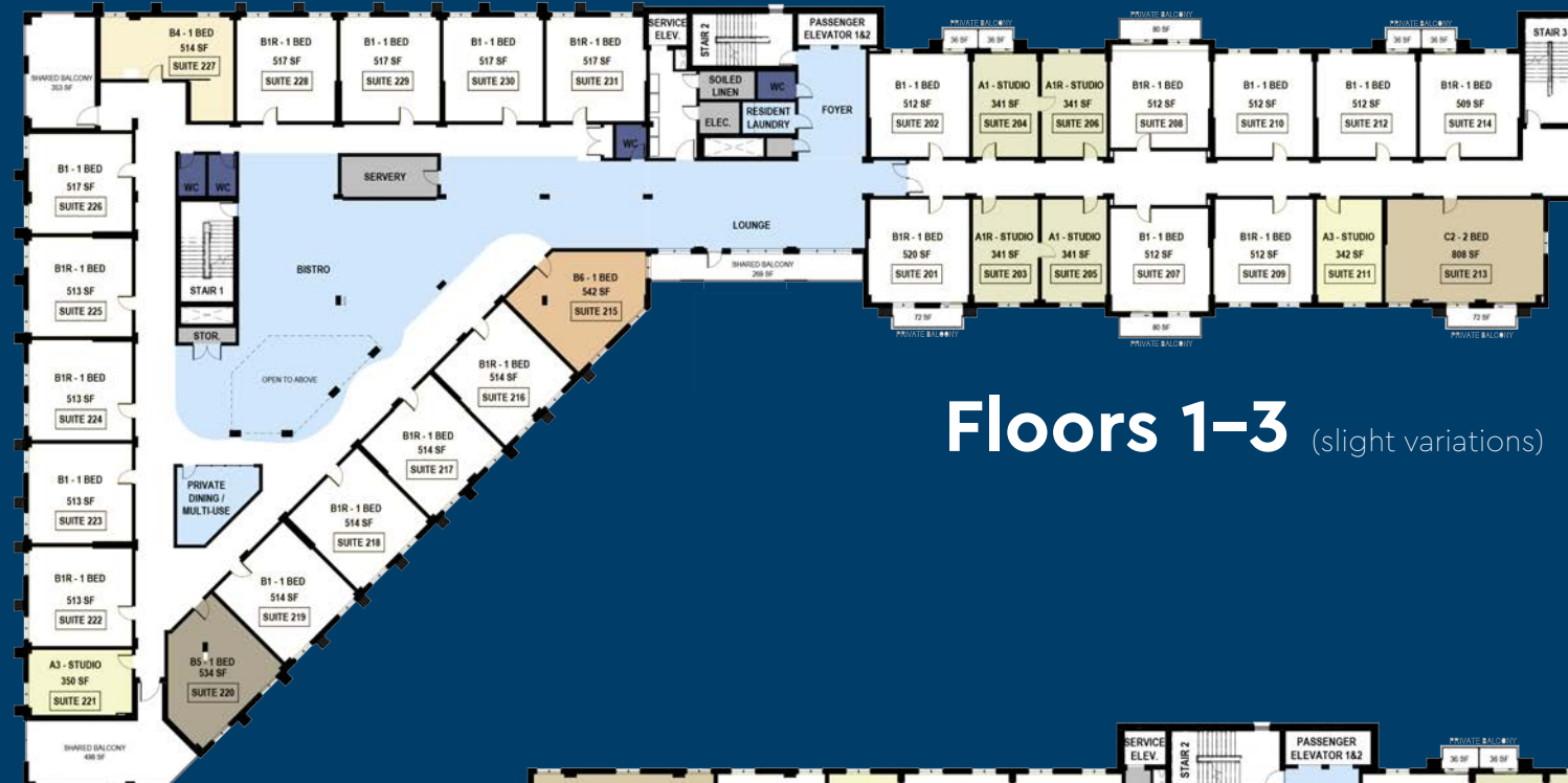
Floors 1-3 (slight variations)