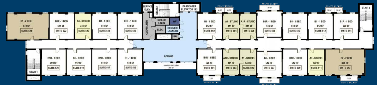
Floors 4-6 (slight variations)